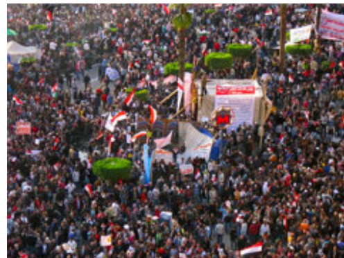
Tahrir square, Cairo on 25 January 2012

The United Nations, the European Union, and the UK all issued freezing orders thirty-seven days after Mubarak was toppled. Alas, nearly two years after not a single dollar has been recovered or returned. Read More »